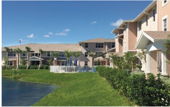
Building Better Communities and Pinnacle Housing Group Host Ribbon Cutting Celebration for Oakland Preserve Multimedia Gallery URL